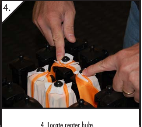
4. Locate center hubs.