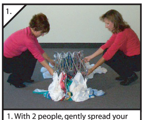
1. With 2 people, gently spread your display.