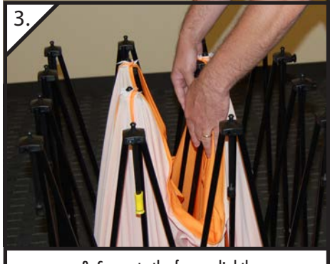
3. Separate the frame slightly. Make sure graphics are not caught on the frame or connectors.