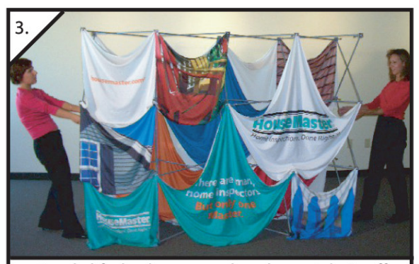
3. Gently lift display upward so the weight is off the ground, this helps all magnetic connectors attach.