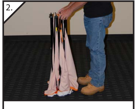
2. Place the frame on the floor graphic side down - feet facing you.