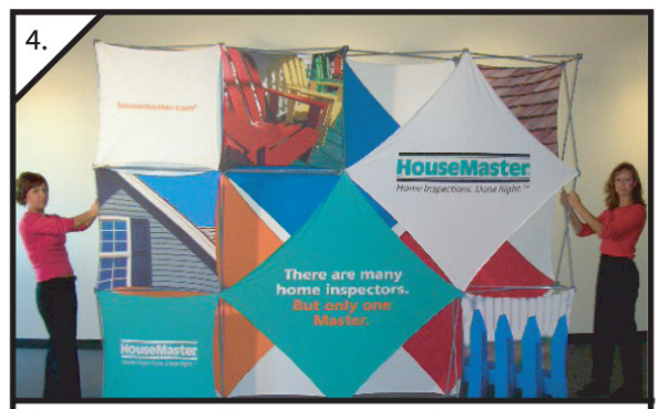
4. autoXlocks will connect on their own! IMPORTANT make sure to manually release the auto x lock before breaking down.