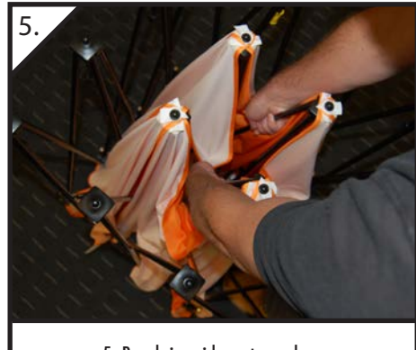
5. Reach in midway to grab the frame poles.